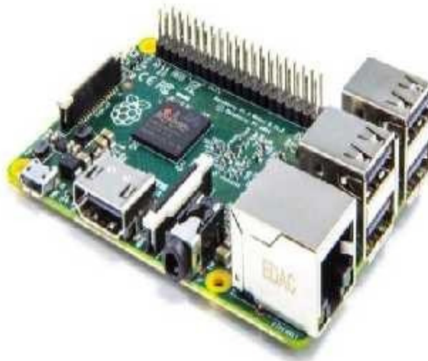
Fig. 2. Raspberry Pi 2 Board