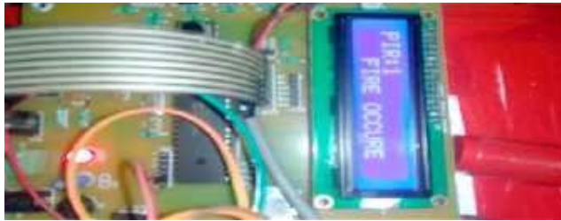
Fig.6.3 Temperature Detection

4. After all the security check it comes to face recognition part where it recognizes the authorized person. If the face matches with the database image, the system lets the person access the area.