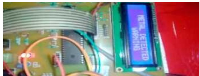
Fig. 6.2 Object Detection

2. In the next stage of security check the system check for the metal. If and metal is detected it creates the threat alarm.