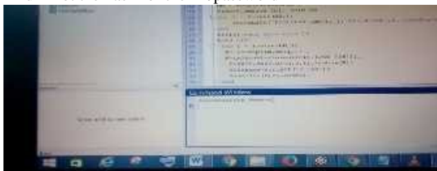
Fig. 6.5 Verification

5. Since the robot is automatic it do everything without any external control but it send the SMS to the control room or owner of the area about the visitor