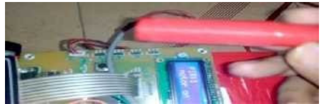
Fig. 6.1 Object Within The Range Of Pir Sensor

1. When any person comes in the range of PIR sensor, the value of PIR will pop up to 1 and hence, proceed to the next stage of security check.