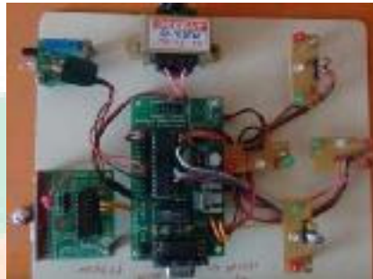
Fig.1. Hardware module

To initiate the serial communication administrator has to configure the Communication. Whenever administrator command microcontroller to send recorded data, the microcontroller send all data, as vehicle count recorded on basis of recording interval, to computer. The microcontroller also sends the running configuration of parameters (Vehicle range values, delays, recording interval) on traffic light. The data can be saved on the computer as excel.