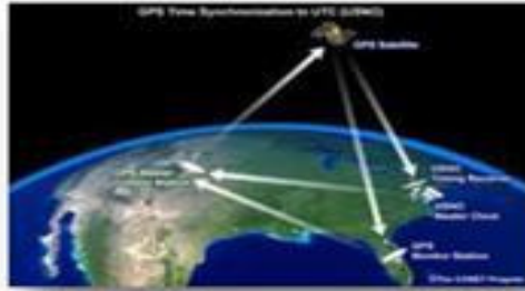
Fig-2 DGP Positioning

The data received contains many details along with latitude and longitude. The latitude and Longitude of the current position is separated from the detailed data from GPS. The current positions are compared with already stored latitude and longitude of countries boundary locations. At first the latitude is compared with stored latitude which identifies if the current position is located near to the boundary. If the latitude matches then the adjacent latitudes and longitudes of the present latitude is retrieved from the microcontroller.