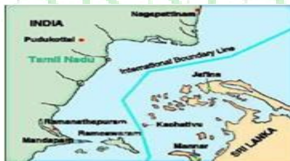
Fig-3 Positoning view

The GPS receivers do not have atomic clocks, there is a great deal of uncertainty when measuring the size of the spheres. Each radius corresponds to the distance calculated to the satellite. All possible distances to the satellite are located on the circumference of the circle.