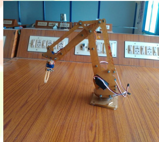
Fig 1: Designed manipulator

This proposed design after implementing the solutions to these design problems is built using five servo motors. The design of the base and the linkers remain the same as the previous one except for changes in the position of controlling motors. The base and the servo motors are connected with a help of a ball bearing for smooth turning. Thus, the rotation of the base causes the entire manipulator along with all the linkers and gripper to have free rotational movement. Separate motors have been fixed in the base for the linkers movement. Thus each linker is aimed to move up to 180°. All the motors are set at the base of the manipulator as shown in Fig 1 and joints for the linkers are given as extra accessories.