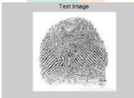
Figure 2. Test Image

The input is processed and verified with the trained image in the database and if it matches with the pre-stored image then the output will be displayed as it indicate the user to cast their vote. The given figure is the test image which is useful in verifying the results by comparing with the database. It also identifies the details in the fingerprint by processing the image while training.