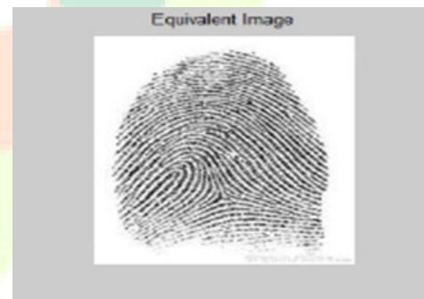
Figure 4. Output Image

The Figure 3 refers to the processed image after the images are classified. The image's information regarding the feature extraction are calculated for matching the test image with the trained image.