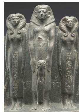
Fig.14 Group statue Ukhhotep II and his family from the 12 th Dynasty [31]