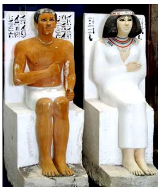
Fig.1 Rahotep and Nofret statue from the 4 th Dynasty [19].