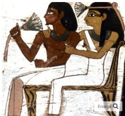
Fig.27 Scene from the coffin of Madja from the 18 th Dynasty [44]