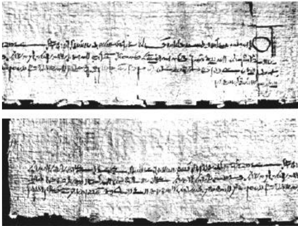
Fig.44 Marriage contract papyrus from the 29 th -30 th Dynasties [65].

audience [63]. Jimmy Dunn announced that after the 26 th Dynasty (664-525 BC), marriage contracts in ancient Egypt included phrases indicating more defined relationship between the marriage partners [64]. Fortunately, some of the marriage contracts wrote by ancient Egyptians are still alive. Fig.44 shows a sample of their contracts which was a papyrus document including a marriage contract dated to the 4 th century BC (29 th -30 th Dynasties) [65]. Most probably it was written using the Demotic script written from right to left in horizontal lines.