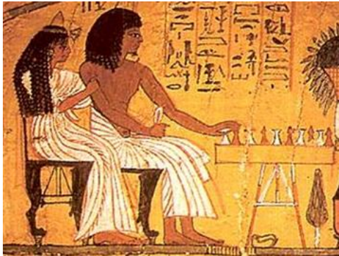
Fig.32 Scene from the tomb of Sennedjem from the 19 th Dynasty [49]