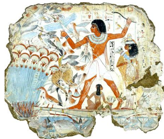
Fig.31 Scene from the tomb of Nebamun from the 18 th Dynasty [48]