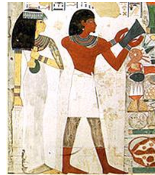
Fig.30 Scene from the tomb of Nakht from the 18 th Dynasty [47]