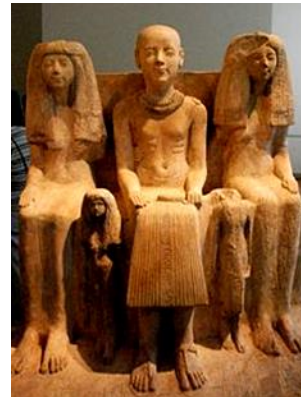
Fig.25 Group statue of Ptahmai and his family from the 19 th Dynasty [42]