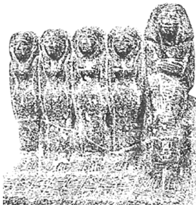
Fig.12 Group statue of Sebek-Hotep and his women from the 12 th Dynasty [3]