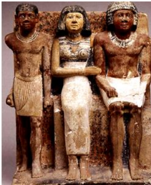
Fig.4 Seked-Kaw, wife and son statue from the 5 th Dynasty [22].