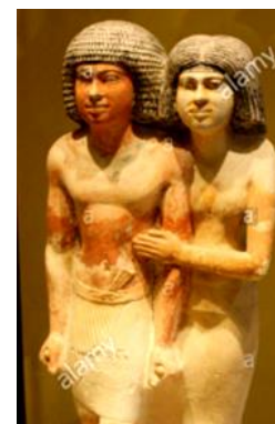
Fig.3 Inspector and his wife statue from the 4 th Dynasty [21].