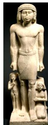
Fig.9 Group statue from 5 th -6 th Dynasties [27].