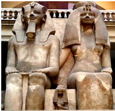
Fig.20 Pair statue of Amenhotep III and Queen Tiye from the 18 th Dynasty [37]