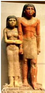
Fig.5 Non-Royal statue from 5 th Dynasty [23].