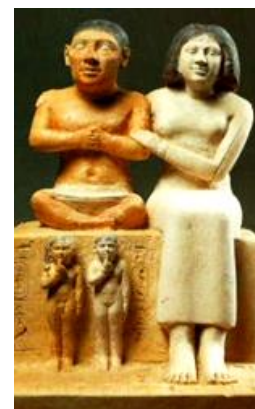
Fig.10 Statue of Seneb 6 th Dynasty [28].