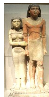
Fig.8 Statue of Nefa from 5 th Dynasty [26].