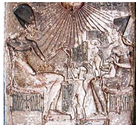
Fig.43 Part of Akhenaten stela, and his family from the 18 th Dynasty [62]