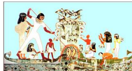
Fig.26 Scene from the tomb of Menna from the 18 th Dynasty [43]