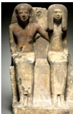
Fig.16 Pair statue of a husband and his wife from the 18 th Dynasty [33]