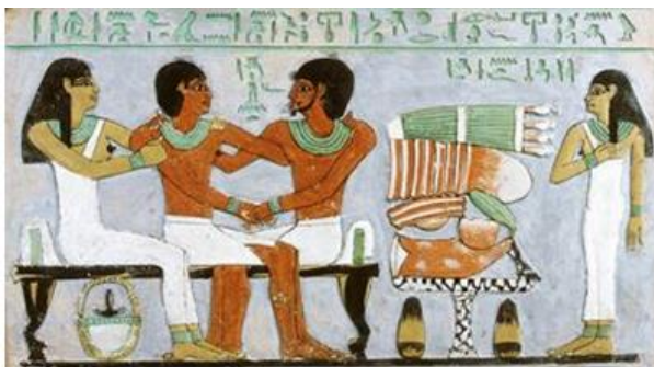
Fig.37 Part of Amenemhat stela and his family from the 11 th Dynasty [56]