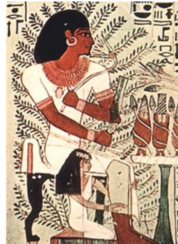
Fig.29 Scene from the tomb of Sennefer from the 18 th Dynasty [46]

his legs. The contours of the scene are not uniform because artifacts criminal robberies cut them randomly from Nebamun's tomb in Luxor and sold them where they settled in a place knows and appreciates this art very well