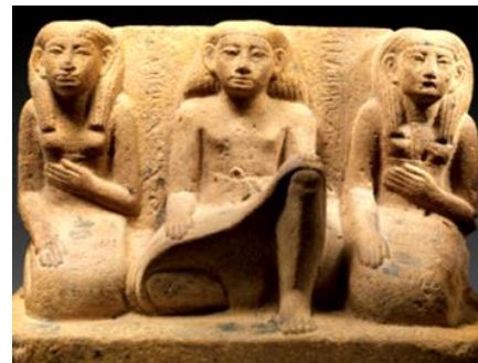
Fig.13 Group statue of Senebu and his family from the 12 th Dynasty [30]

group statue of Senebu, The Overseer of Stonemasons and his family from the 12 th Dynasty (1981-1802 BC) in display in the Metropolitan Museum of Art at NY and shown in Fig.13 [30]. The two ladies beside him from both sides look young which means that may be either two wives or a wife and his or her sister. No intimate position depicted in this statue.