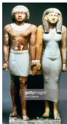
Fig.6 Couple statue from 5 th Dynasty [24].