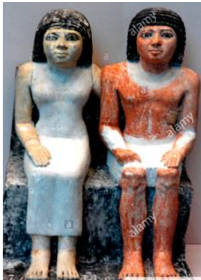
Fig.11 Statue of Kaitep and his wife from the 6 th Dynasty [29]

The approach of using pair or group statues to authorize marriage in the ancient Egyptian society continued to be followed during the Middle Kingdom (11 th and 12 th Dynasties). Here are some examples: