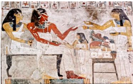
Fig.28 Scene from the tomb of Rekhmire from the 18 th Dynasty [45]