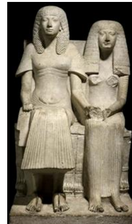
Fig.21 Pair statue of Horemheb and one of his wives from the 18 th Dynasty [38]