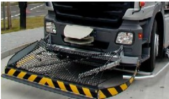
Fig 5: prototype of a vehicle attached with line follower.

To avoid traffic when the vehicle comes to halt we include line follower concept where the vehicle tracks and arranges itself in order with respect to the line drawn on the road. to avoid any traffic jam.