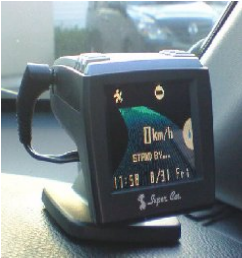
Fig 4: shows the speed of the vehicle gets reduced.