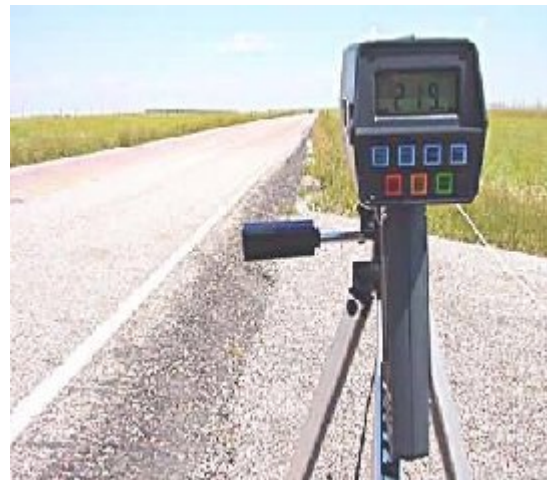
Fig 3: speed gun located at the distance of 500 meters from the traffic signal

To reduce the miscalculations by human beings while crossing the signal that cause accidents we propose this idea. Here the speed gun where it measures the speed of the moving vehicle which is installed at the distance of 500 m from the traffic signal, the data is sent to speed controller device and the traffic signal also gives necessary data to the speed control device.